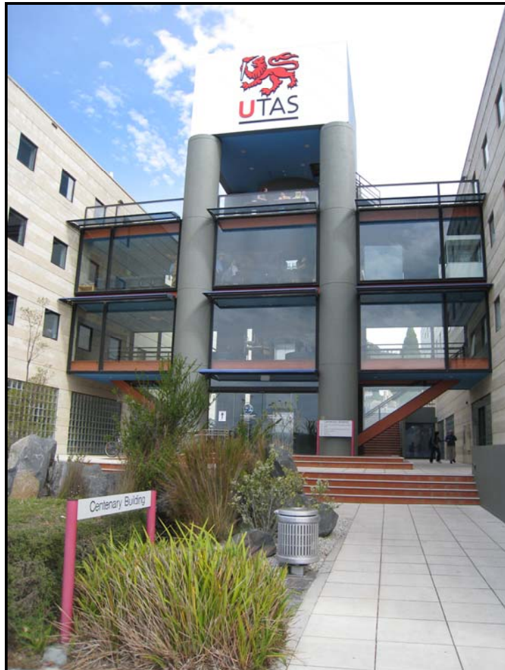
Centenary Building, Sandy Bay

If you do not have a TER of 90, you may still apply for entry. You should apply for a relevant degree with the units 'Introduction to Law and Legal Systems' in 2010 and be assessed at the end of the first year of study for transfer to a combined or straight Law degree.