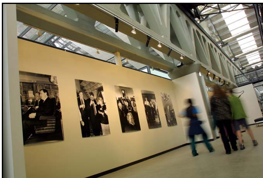
Academy of the Arts, Inveresk

NOTE: Dates are correct at time of printing but may be subject to change.